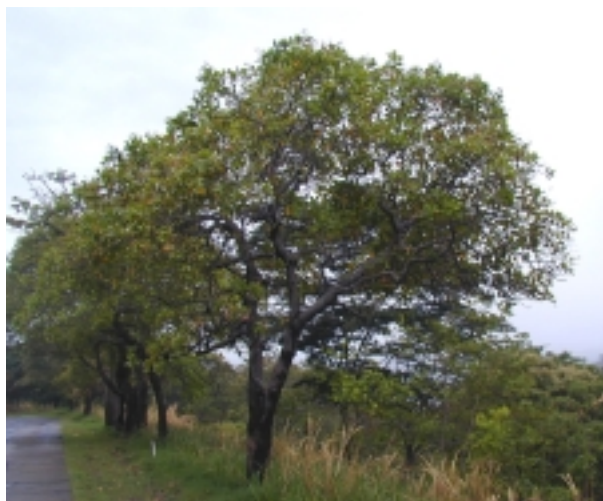
Roadside plantings. Canal Zone, Panama.

There is no dormancy, and fresh nuts can be sown without pretreatment. After storage it is recommended to soak the nuts in cold water for 24 hours before sowing. Scarification may be necessary for some seedlots.