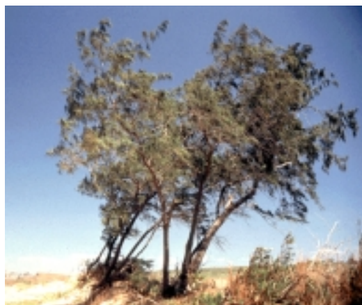
Naturally occurring trees at Wah Wee Beach, West Arnhem Land, Northern Territory, Australia.