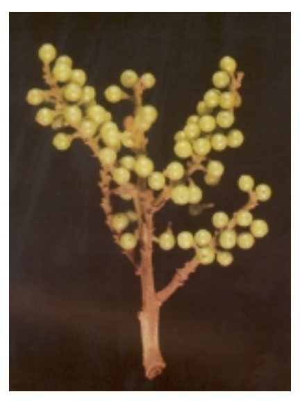
Immature fruits. From: Flores 1993.

Vegetative propagation with pseudocuttings is also possible.