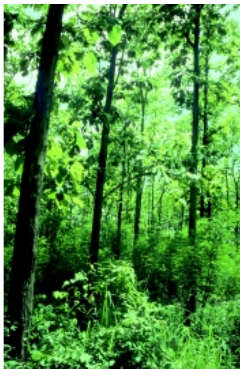
Natural teak forest close to Ban Cham Pui, Lampang district, Northern Thailand.

after sowing, but spreads over a very long time, especially if no pretreatment has been made.