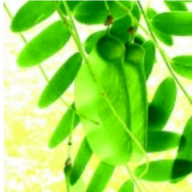
Foliage and immature fruits.